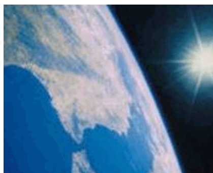
All under the same roof

appeals and recommendations. If it is true, as Monterrey stated, that these issues are more important than ODA, the statements about them are nothing less than disappointing. The only positive step is the proposal for an international procedure to settle debt involving both debtors and creditors. The “Monterrey Consensus” merely repeats the promise that further trade and investment liberalisation will enable the private sector to take care of the world’s poor, despite growing evidence to the contrary. The “Consensus” was pushed through at the prepcoms in New York, discounting the many progressive and pragmatic